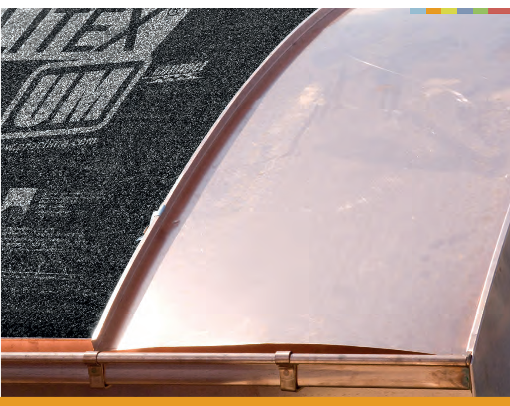
Four-layer underlay with 3D separation layer and self-adhesive strip

Faster and safer construction of metal roofs, sheet wall cladding and wall shingles